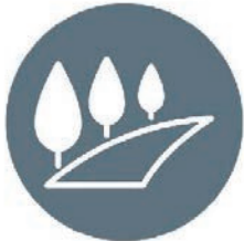
Aesthetic and Noise Reduction