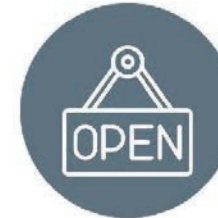
Business and Community Needs