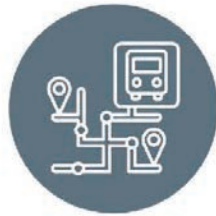
Walkability and Transit Access