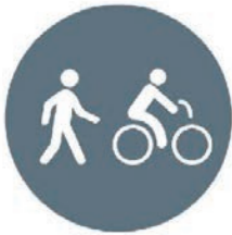
Pedestrian and Bicycle Safety