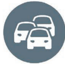
Traffic Flow and Vehicle Safety