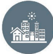
Mixed-Use Development and Housing